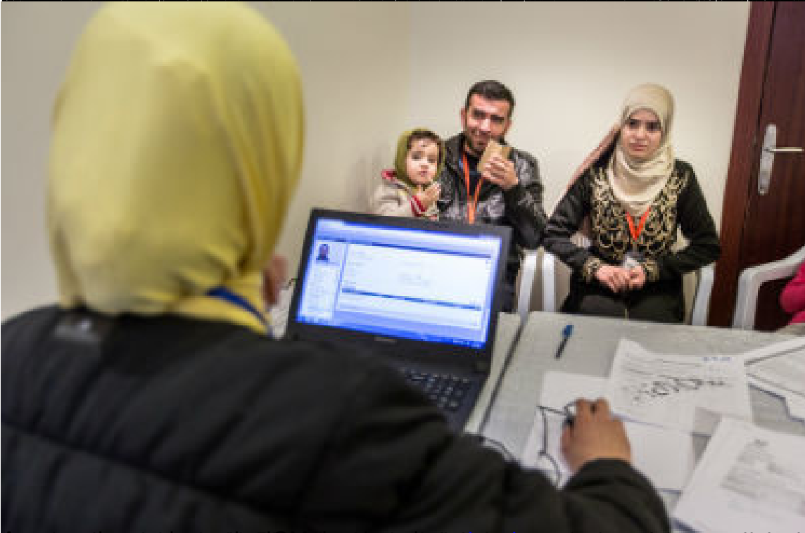
Digitization for development: how technology can save and improve lives