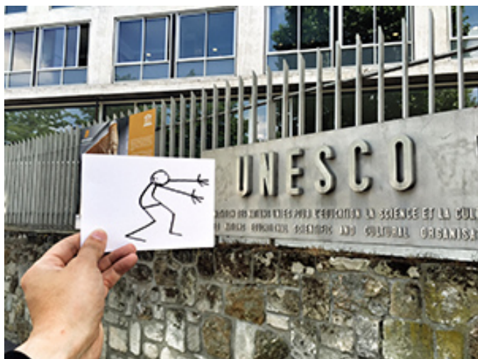
Whilst in Paris, Elyx paid a visit to UNESCO Headquarters, the UN agency for education, science and culture.